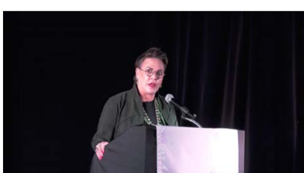
Watch My Remarks to the Greater Cheyenne Chamber of Commerce