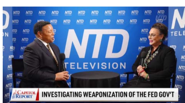
I Talked with Capitol Report About the FBI's Conservative Censorship Campaign