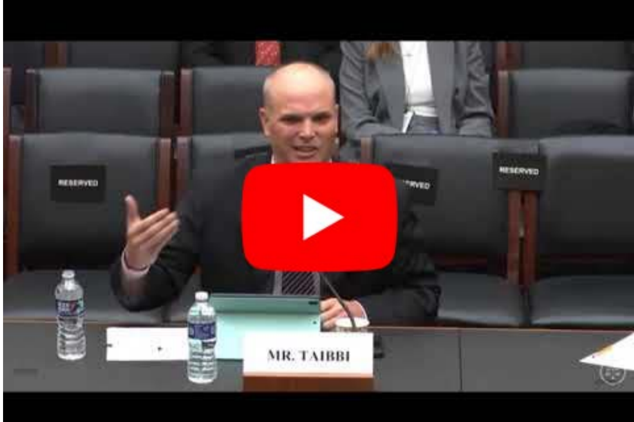
Exposing Federal Censorship in the Twitter Files