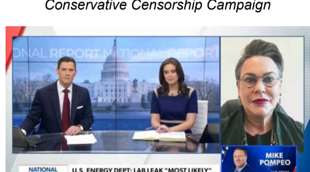
The Energy Dept and FBI Now Say COVID Started in a Lab... Here are My Thoughts