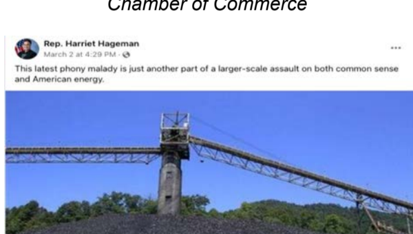
Read My Op-Ed on 'Ecogrief'